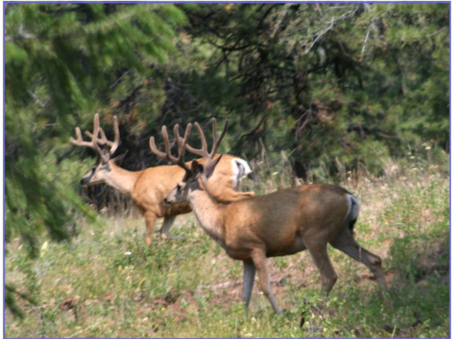
Photos taken from Low Gap Rd on or near the property